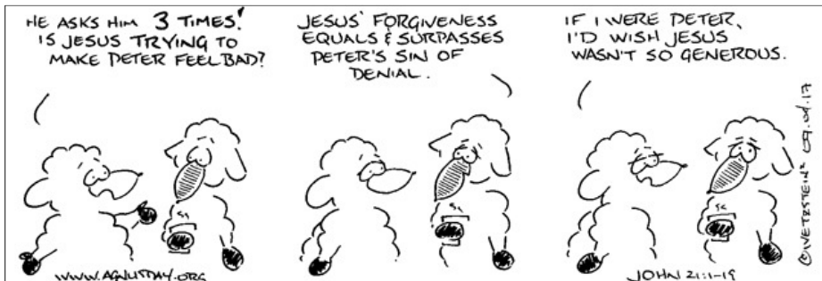
"Agnus Day" appears courtesy of www.agnusday.org