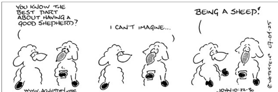
"Agnus Day"

Spring Fund-Raiser. For the May 22 spring fund-raiser, we are looking for the following donations: hostas, ferns, geraniums, peonies, and other plants. We also are looking for statues, bird feeders, bird houses, birdbaths, lawn ornaments and other fun garden art. If you can donate baked goods, we also will appreciate those. Information: Kitty Seck, 952-448-4356, or Rita Lundquist, 952-448-4490.